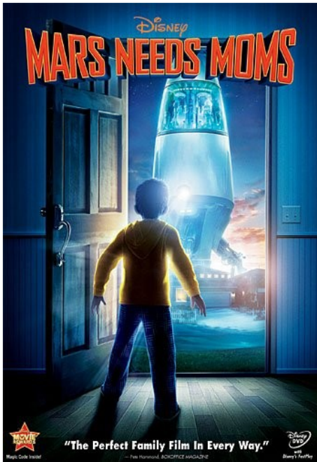
November 17 (PG)

Thursdays at 6:00 p.m.—You may bring your own beverage and snacks. We'll provide the popcorn! Movies are shown on a large screen in the Meeting Room. Registration not required.