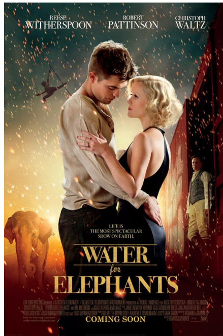
December 1 (PG-13)